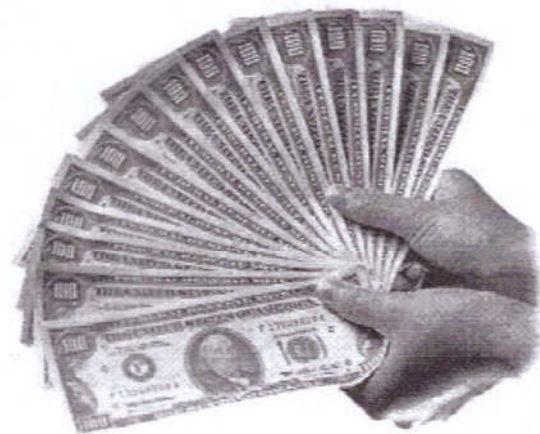
USPS PRIORITY MAIL, WITH DELIVERY CONFIRMATION. This ensures fast and safe delivery of cash to all participants.

Each member gets 1,000 flyers printed and mailed for them in #1 position. Simply mail a few copies each day. When someone under you sign up, they get 1,000 get mailed for them with your name in #2 position, and when those people get someone signed up under them, we mail another 1,000 with your name in position #3.