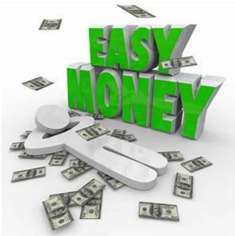
FIGURE IT OUT ON YOUR OWN. 100% AUTOMATED!