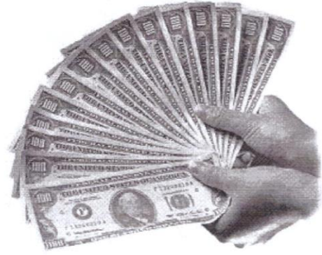
USPS PRIORITY MAIL, WITH DELIVERY CONFIRMATION. This ensures fast and safe delivery of cash to all participants.

Each member gets 1,000 flyers printed and mailed for them in #1 position. Simply mail a few copies each day. When someone under you sign up, they get 1,000 get mailed for them with your name in #2 position, and when those people get someone signed up under them, we mail another 1,000 with your name in position #3.